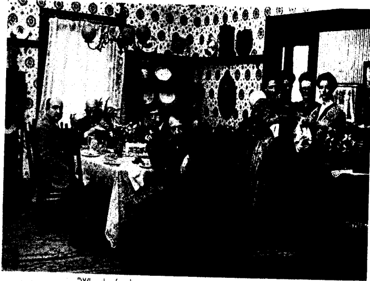
"When the after dinner cigars were passed and the political discussion began, she would rise gracefully and lead the ladies into the sitting room."